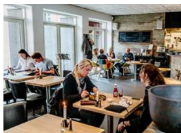
Den Gyldne Okse